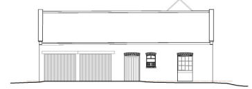
95.0m ACD Elevation 29 South Elevation