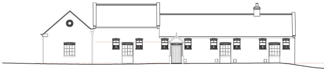
95.0m ACD Elevation 28 East Elevation