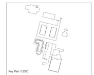
Key Plan 1:2000