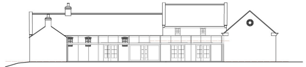
95.0m ACD Elevation 30 West Elevation